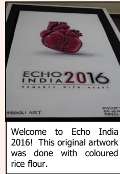
Welcome to Echo India 2016! This original artwork was done with coloured rice flour.

The conference turned out to be a great success. It was hailed as an excellent source of education and was awarded 35 credit points by The Tamil Nadu Dr MGR Medical University.